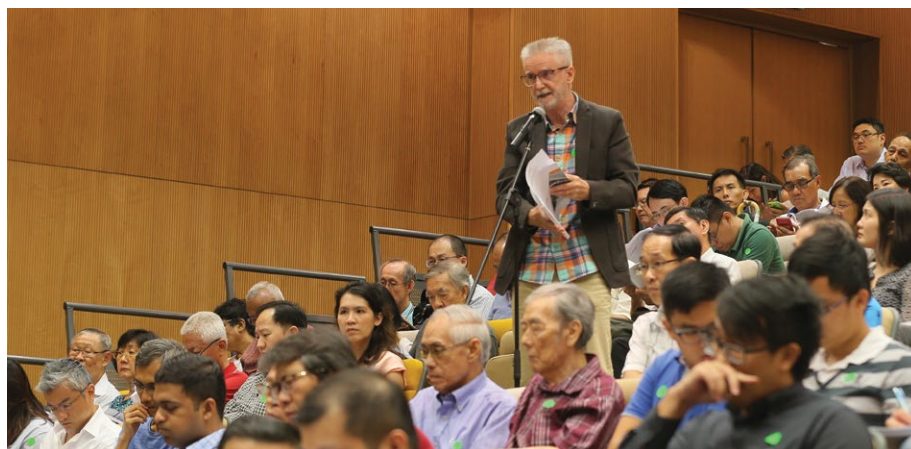
Q&A session during MLT's 8th Annual General Meeting

to validate the vote tabulation procedures. For greater transparency, minutes of the AGM are made available on MLT's website.