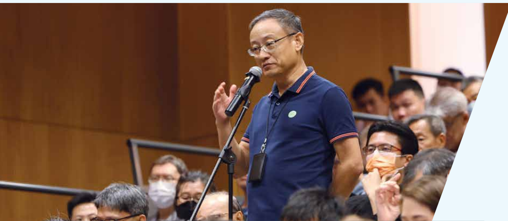
Q&A session during MLT's 15th Annual General Meeting

At MLT, we are committed to building trust and delivering long-term value through active, transparent, and timely engagement with our unitholders and the broader investment community. We believe that excellence in investor relations ("IR") plays a vital role in reinforcing unitholder confidence and supporting the fair valuation of our equity in the capital markets.